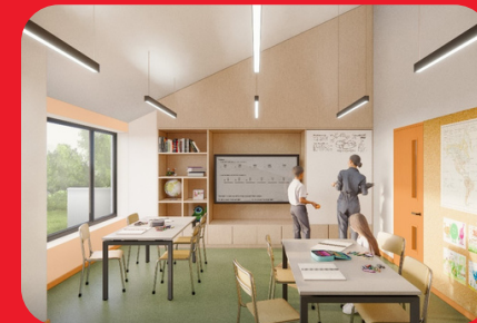
Architect's image of one of six new classrooms

Andrew Marshall, our architect at 3DReid , led on a series of workshops with children and staff early in the design process of our new school. On creating the interior design for the new project Andrew has said that, “developing the trauma— informed design of the school in conjunction with staff and children has been exhilarating. Dovetailing with our earlier workshops, where we focussed on the building fabric and architecture, we are now at a new stage of the process, exploring how the materials and colours will influence the feel of the new spaces. Together with the use of textures and creatively designed lighting, we will create a perfect environment for nurturing curiosity and learning for Seamab’s children and young people.”